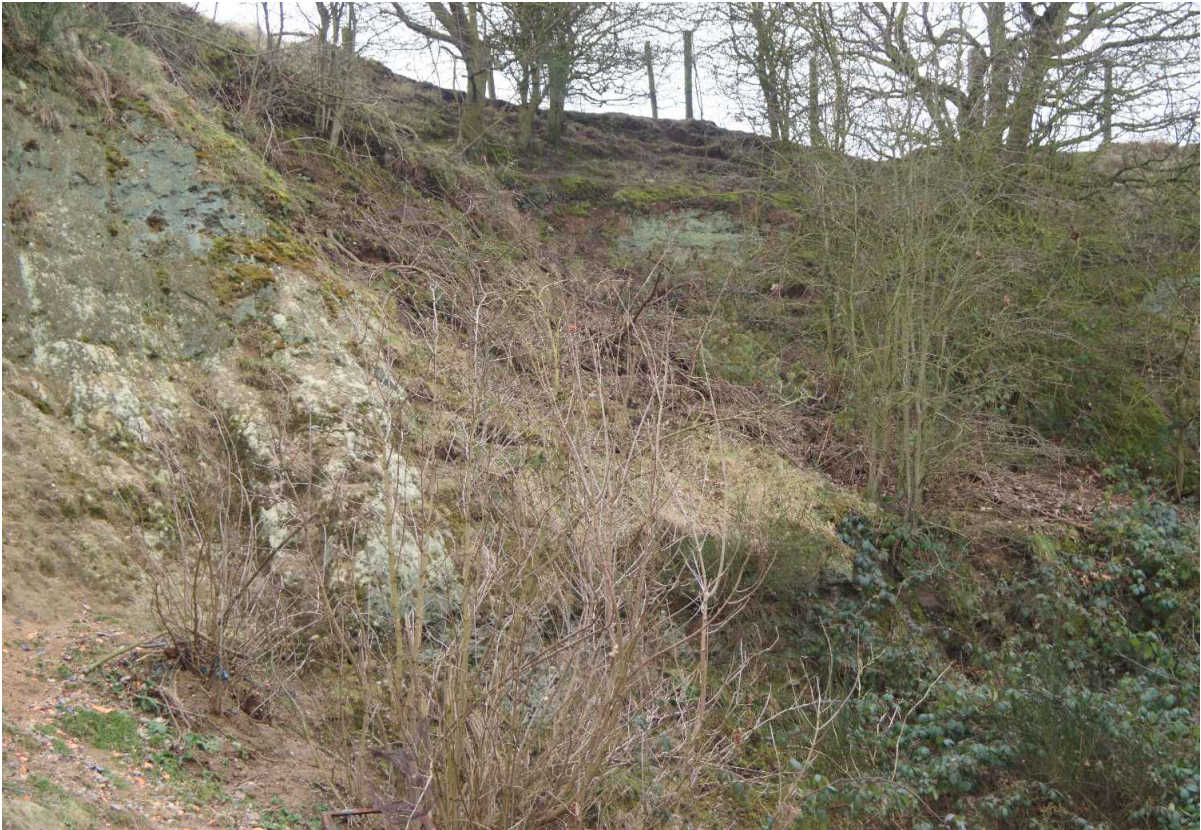
Warwickshire Geological Conservation Group 2009