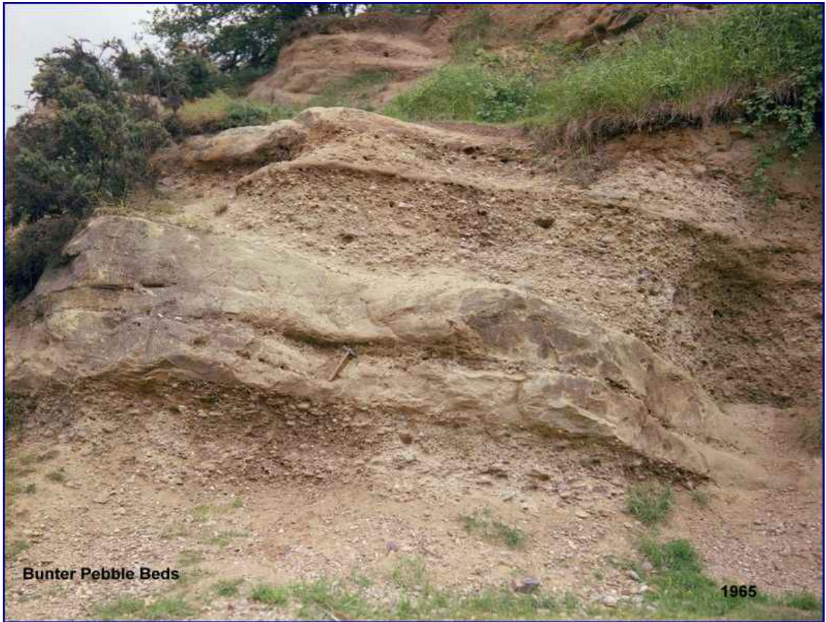
Bunter Pebble Beds