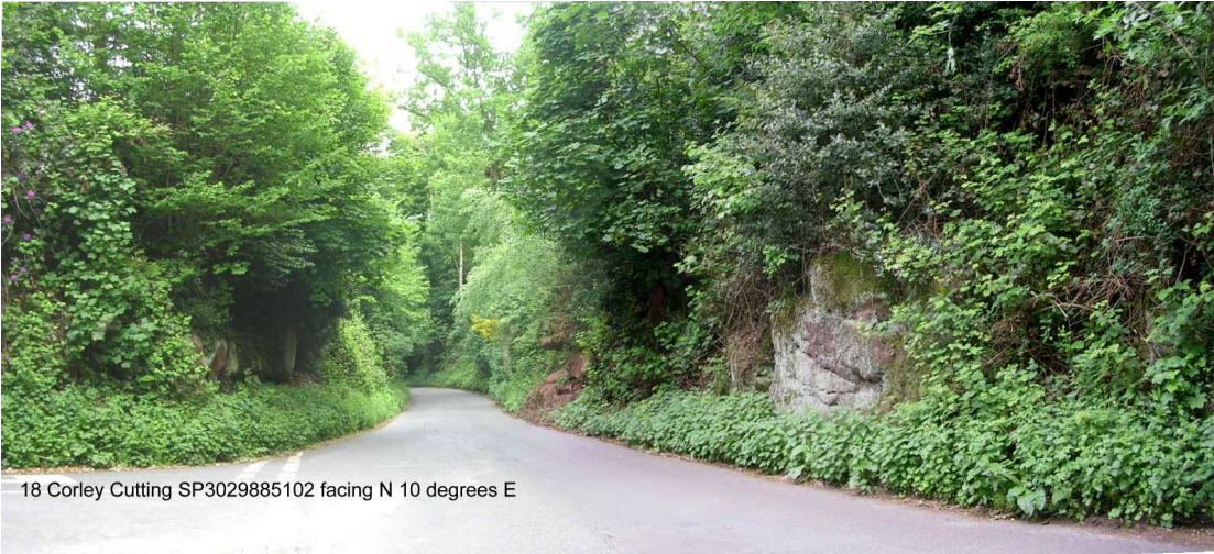
18 Corley Cutting SP3029885102 facing N 10 degrees E