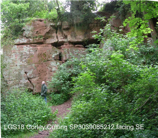
LGS18 Corley Cutting SP3039085212 facing SE