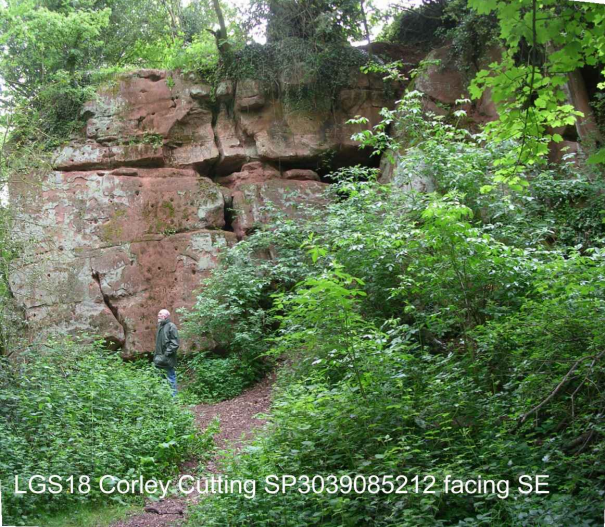
LGS18 Corley Cutting SP3039085212 facing SE