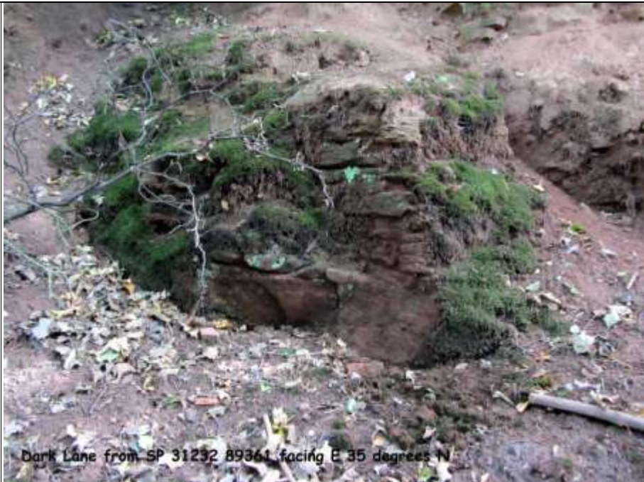
Dark Lane from SP 31232 89361 facing E 35 degrees N