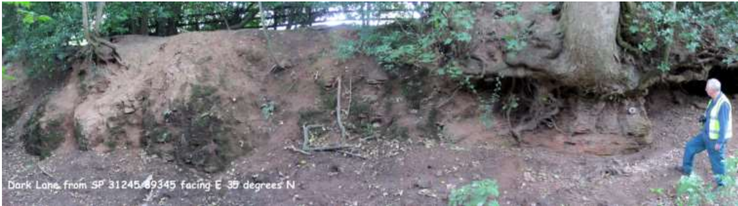
Dark Lane from SP 31245 89345 facing E 35 degrees N