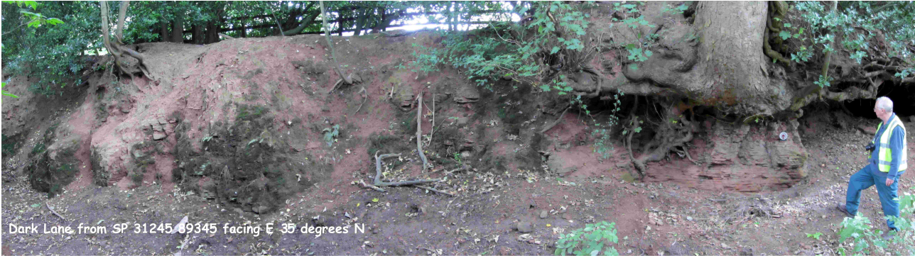
Dark Lane from SP 31245 89345 facing E 35 degrees N