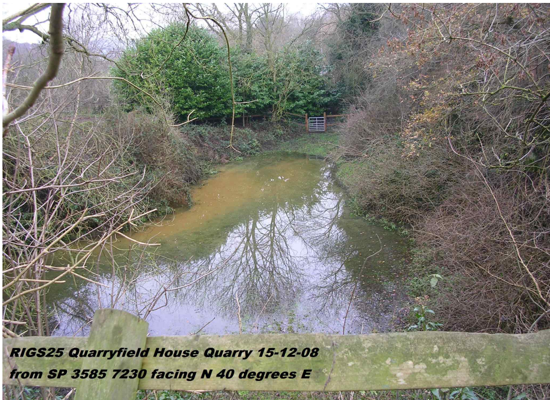
RIGS25 Quarryfield House Quarry 15-12-08 from SP 3585 7230 facing N 40 degrees E