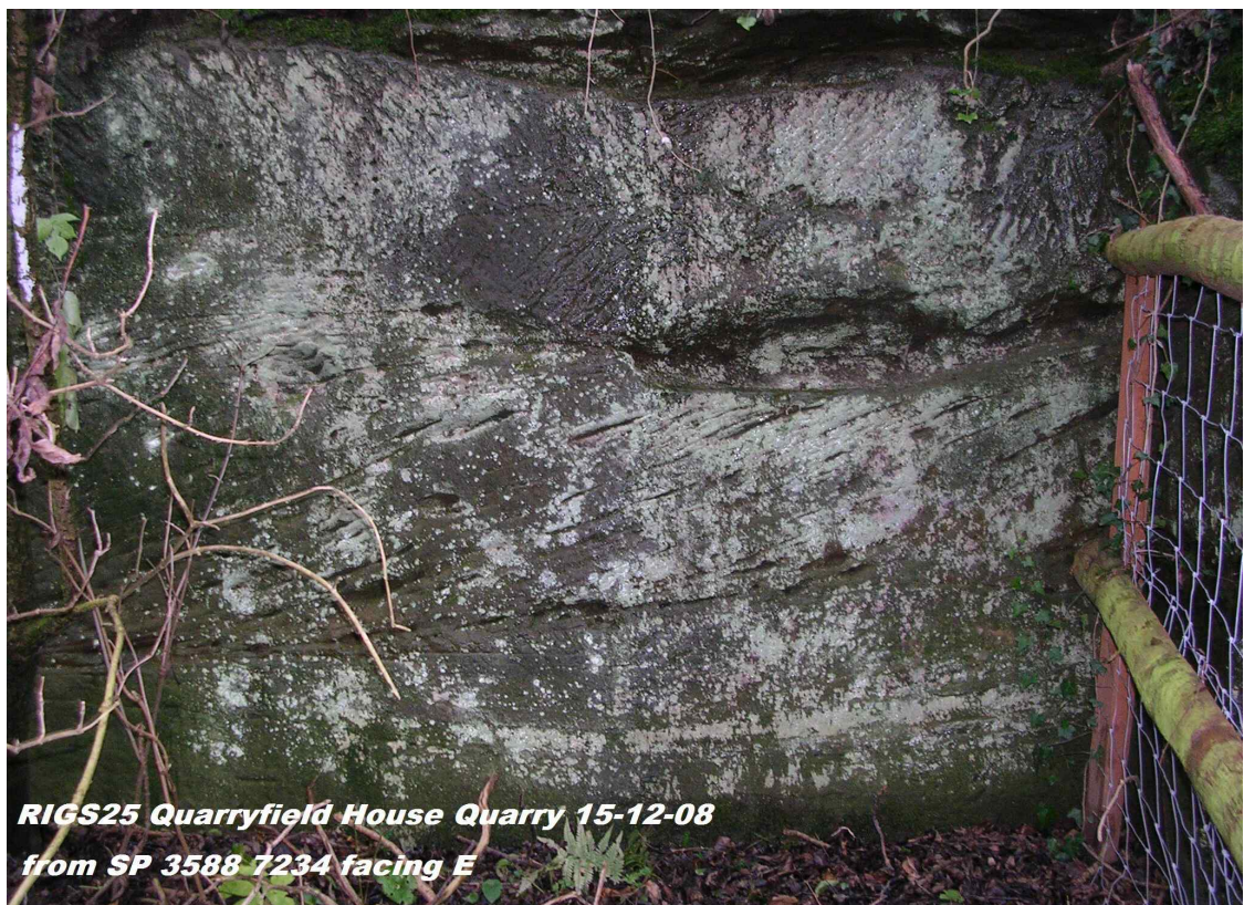
RIGS25 Quarryfield House Quarry 15-12-08 from SP 3588 7234 facing E